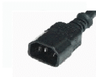
IEC320 C14 10A plug